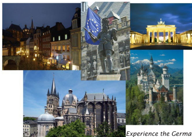
Experience the German Culture and Heritage