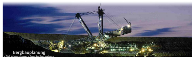
Bergbauplanung - Bild: Abraumabgeber - Braunkohlentagebau -

For pre- and post-congress tours, we will offer appropriate links on the ISM 2013 Congress Website.