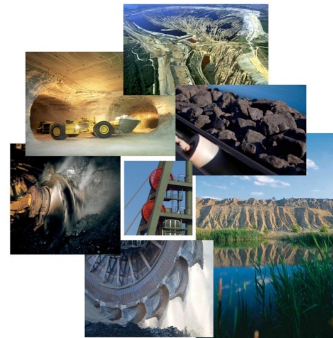
Impressions of Mining in Germany

In the beautiful city of Aachen, Europe is more than a mere word. Here Europe is alive! In the immediate vicinity to The Netherlands and Belgium, people are used to meet each other across the „borders“ and to work in cooperation with each other. This attitude has shaped the city and has made its people more open to others.