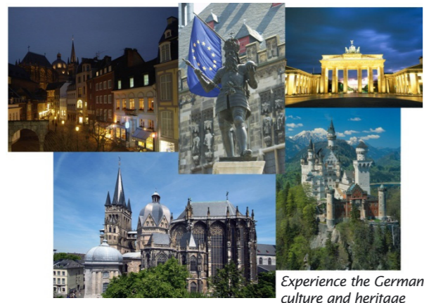
Experience the German culture and heritage